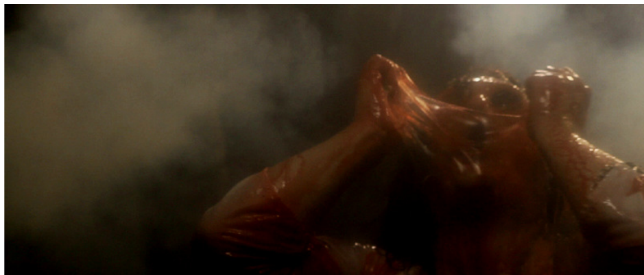
ALAN ROWE KELLY as Annabelle in The Big Bad